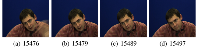
Figure 3: Example of hesitation from the AVIC corpus, Subject VP8, frames 15476 to 15497.